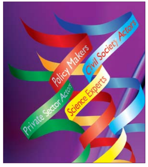
Figure I: Quadruple Helix

The CSP programme will target the quadruple helix at all phases of the programme using its P-Q-R-P framework for socialization of science in African society.