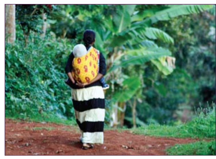
The Climate Sense Programme will find new ways to communicate Figure 2: Most African countries rely on agriculture for their survival. They depend on natural ecosystem services and regular rainfall for food security and rural livelihoods; abundant biodiversity and wildlife for tourism to thrive.

The Climate sense programme intends to translate complex climate economics in ways that promote dialogue at all levels of African society and globally.